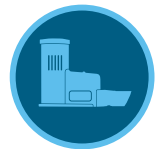
Rain-Clik Sensor Page 144