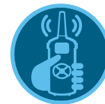
ROAM Remote Page 137 ROAM XL Remote Page 138