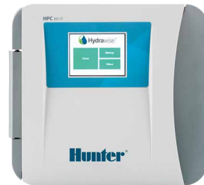
HPC Face Panel