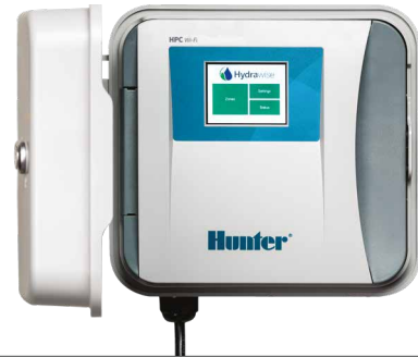
HPC (plastic indoor/outdoor) Height: 22.9 cm Width: 25.4 cm Depth: 11.4 cm