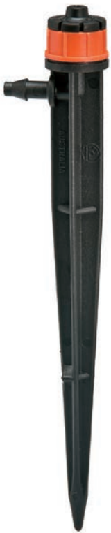
Shrubbler® 360° PC Spike 4 mm