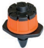
Shrubbler® 360° PC Barb 4 mm