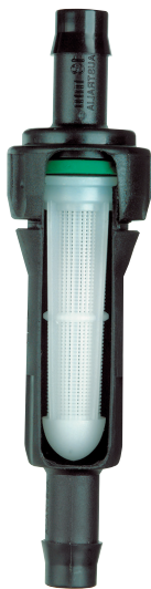
In-Line Filter screen detail